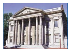
14 THE FIRST BANK OF THE UNITED STATES Sparked the first great Constitutional debate