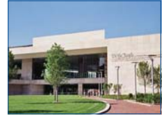
20 NATIONAL CONSTITUTION CENTER Exercise your right to explore the Constitution of the U.S.

Call: 215.525.1776 Click: www.TheConstitutional.com/group Group Tours & Private Tours available year-round with advance reservations. *Parties of 25 or more