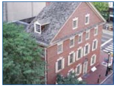
2 DECLARATION HOUSE Where Thomas Jefferson wrote The Declaration of Independence