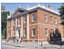
10 LIBRARY HALL The nation's first public library and the former Library of Congress