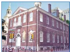
6 CONGRESS HALL The former U.S. Capitol and site of two Presidential Inaugurations