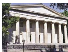
11 SECOND BANK OF THE UNITED STATES One of the most influential financial institutions in the world, now a portrait gallery