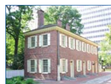
13 NEW HALL MILITARY MUSEUM Interpreting the role of the military in early U.S. history