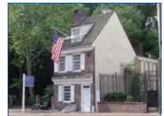
17 BETSY ROSS HOUSE Where Betsy Ross sewed the first Stars and Stripes