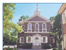
12 CARPENTERS' HALL The birthplace of the American identity