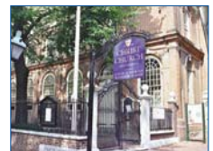
16 CHRIST CHURCH An active parish since 1695, often called the "Nation's Church"