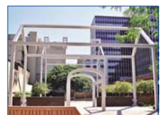
15 FRANKLIN COURT & B. FREE FRANKLIN POST OFFICE Ben Franklin's home and the only Colonial-themed Post Office