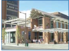
1 INDEPENDENCE VISITOR CENTER Your adventure begins