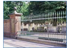
19 CHRIST CHURCH BURIAL GROUND The final resting place of Benjamin Franklin