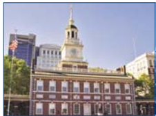
5 INDEPENDENCE HALL America's Birthplace